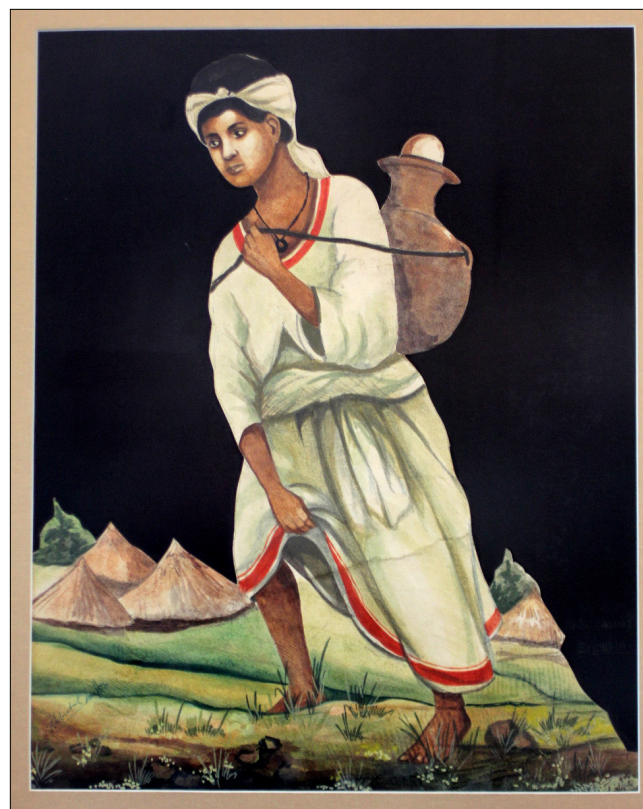
Ethiopian Water Carrier

Gender dimensions: Inadequate access to water and sanitation hinder women’s education, health, and livelihoods. In Africa, women com-