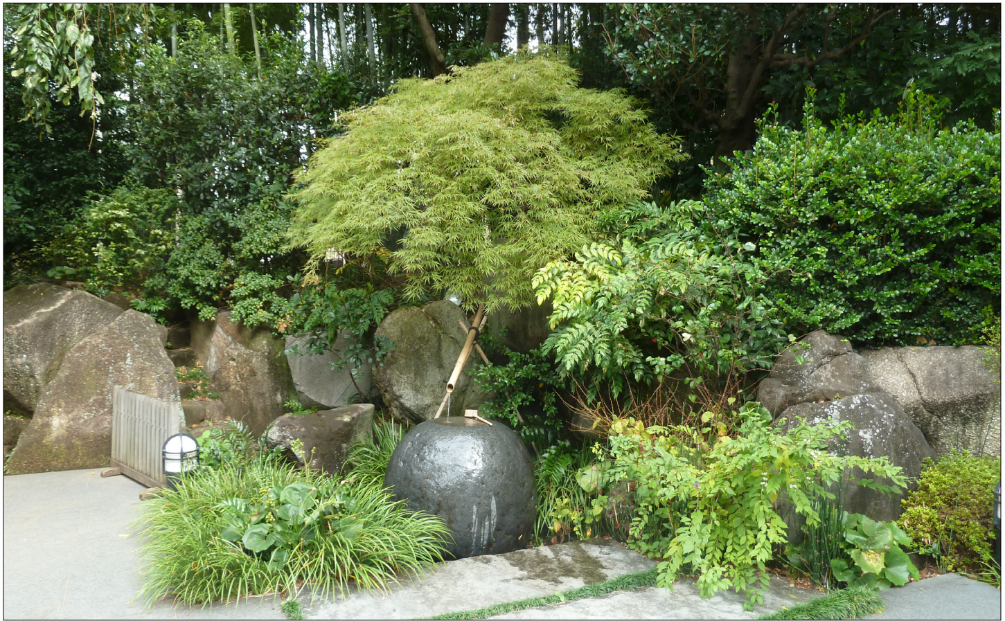
Rissho Ko-Sekei Center, Buddhist Garden, Japan

to help them feed themselves through improved irrigation techniques. One of the poorest districts in the country, Phalombe, has benefited by the introduction of the treadle pump. Operated much like a stair-stepper, the treadle pump is used by community members to pump water from a local river to nearby fields. The goal of a communal garden planted with a variety of food crops has been achieved.