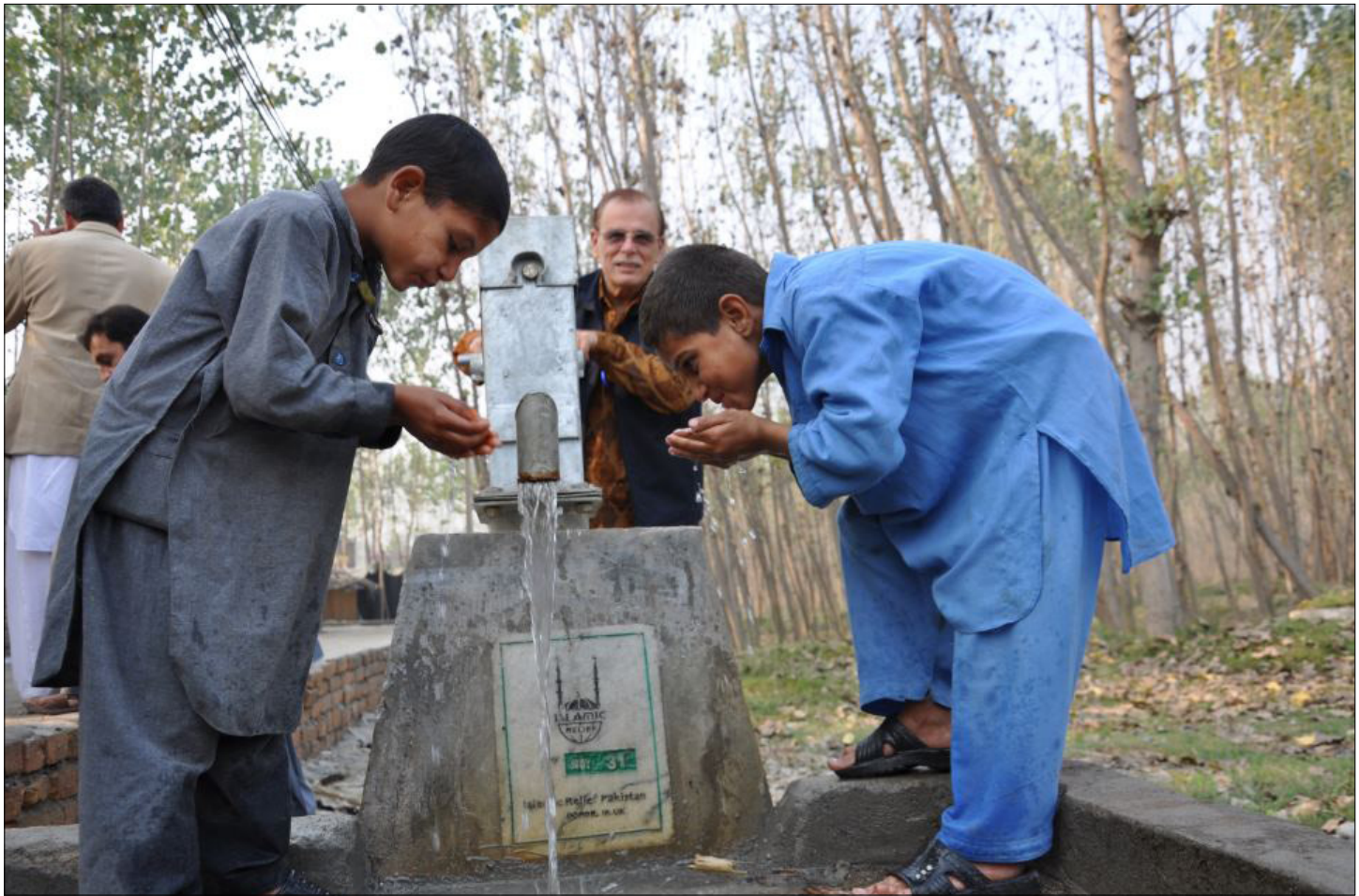
This pump, installed by Islamic Relief in Agra Bagh village which was destroyed by the 2010 floods, is providing fresh water to the community